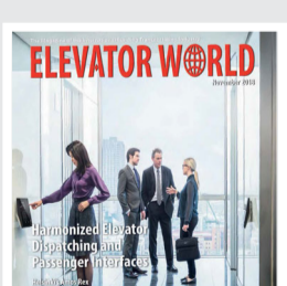
Elevator World, USA November 2018 Link to Original Article