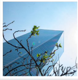
Faria Lima B32, São Paulo Completed 2021 Design Architect: PEI Architects Elevators: thyssenkrupp