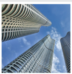
World One, Mumbai Completed 2020 Design Architect: Pei Cobb Freed Elevators: Schindler